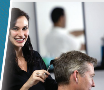
Hairdressers, beauty salons, services