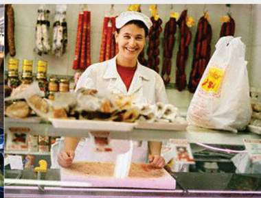
Butchers, groceries, liquor stores