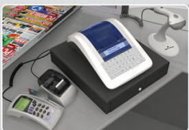
Wide range of connection possibilities to external facilities.