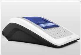
Modern and ergonomic design for the best suitability.