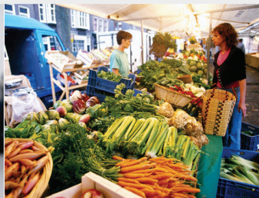
Marketplaces, newsstands, bufets