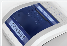
Good readable backlit display for customer and user.