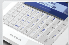
Durable plastic keyboard for easy handling.