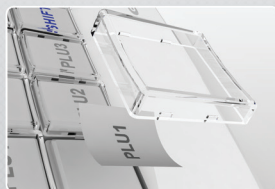
Fully programmable keyboard with replaceable key descriptions.