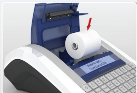
Comfortable and fast paper roll changing by drop-in system.